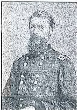
Gen. George Stoneman